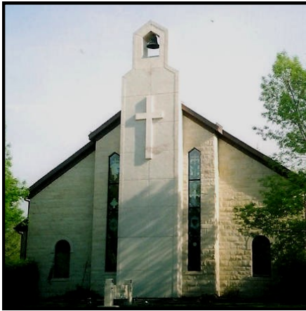
St. Rose of Lima Council Grove, Kansas

October 20, 2019 Twenty-ninth Sunday in Ordinary Time